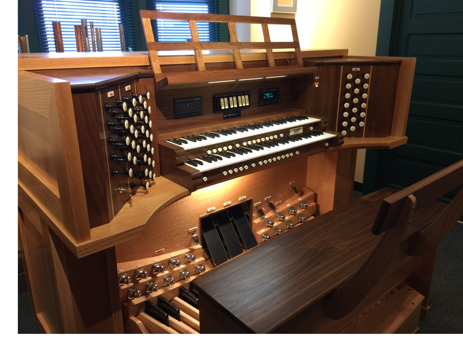
The organ console is powered up - lights on!